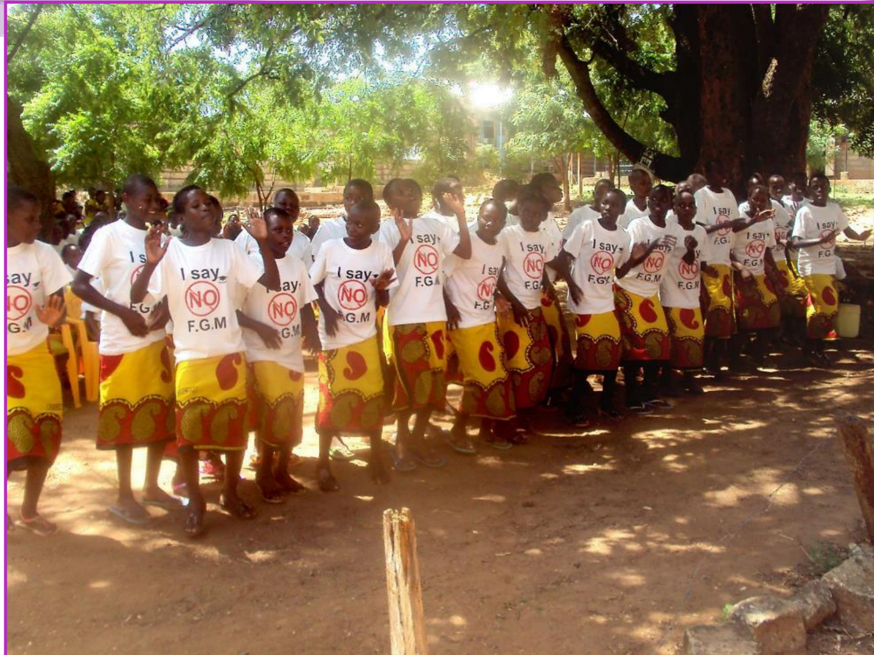
Tharaka-Nithi County, Kenya